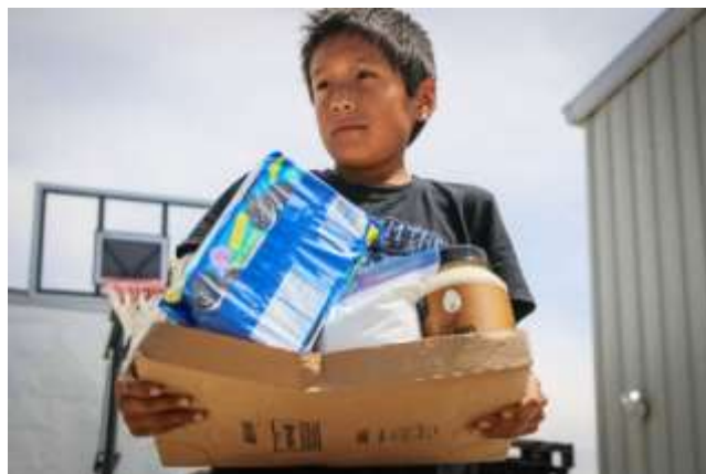
Indian Boy with food

This week we started serving hot meals, too, made from our recovery foods. It started for the elders because the senior feeding program closed, but now it is for everyone. We served 150 people each day this week. We asked the Catholic Church to use their building in town to be more convenient, but they had every reason to put us off. Now we are also delivering to senior housing and the veterans center.